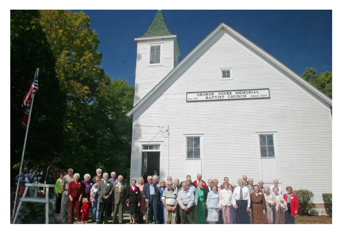
A gathering of Wheat residents during a recent Wheat homecoming held the first Sunday in October each year