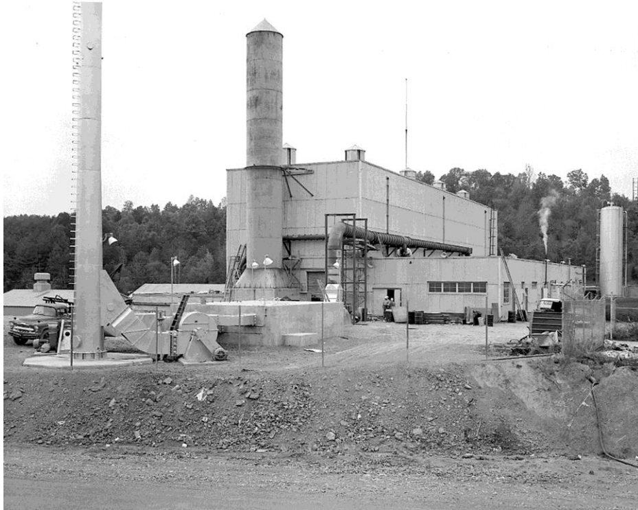
Construction of the Molten Salt Reactor Experiment (MSRE), November 1962

(As published in The Oak Ridger's Historically Speaking column on December 9, 2013)