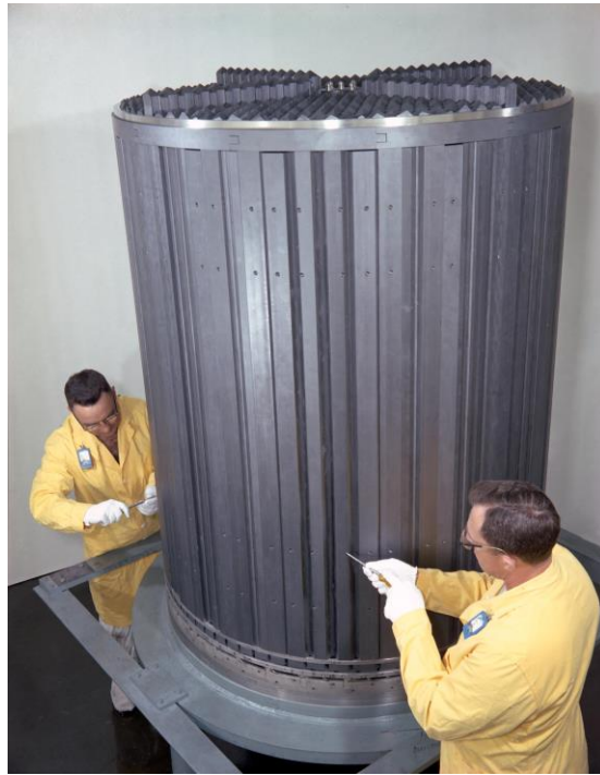
Molten Salt Reactor Experiment - Men working on a MSRE core assembly, March 1964

(As published in The Oak Ridger's Historically Speaking column on December 9, 2013)