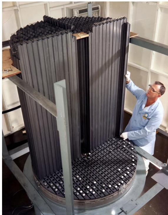
Molten Salt Reactor Experiment - Man working on graphite assembly for the MSRE, January 1964