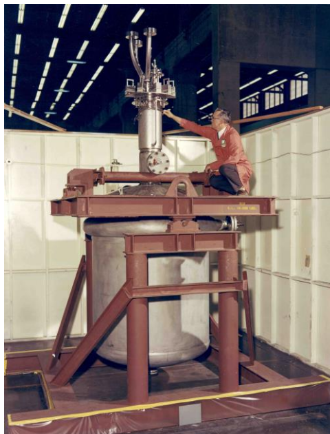
Molten Salt Reactor Experiment - MSRE reactor vessel in a shipping jig, July 1964