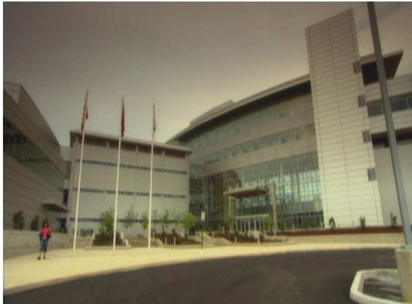
The Spallation Neutron Source, the discoveries and innovation of the world's most powerful pulsed neutron source

Here is the link again: www.vimeo.com/channels/oakridgestories